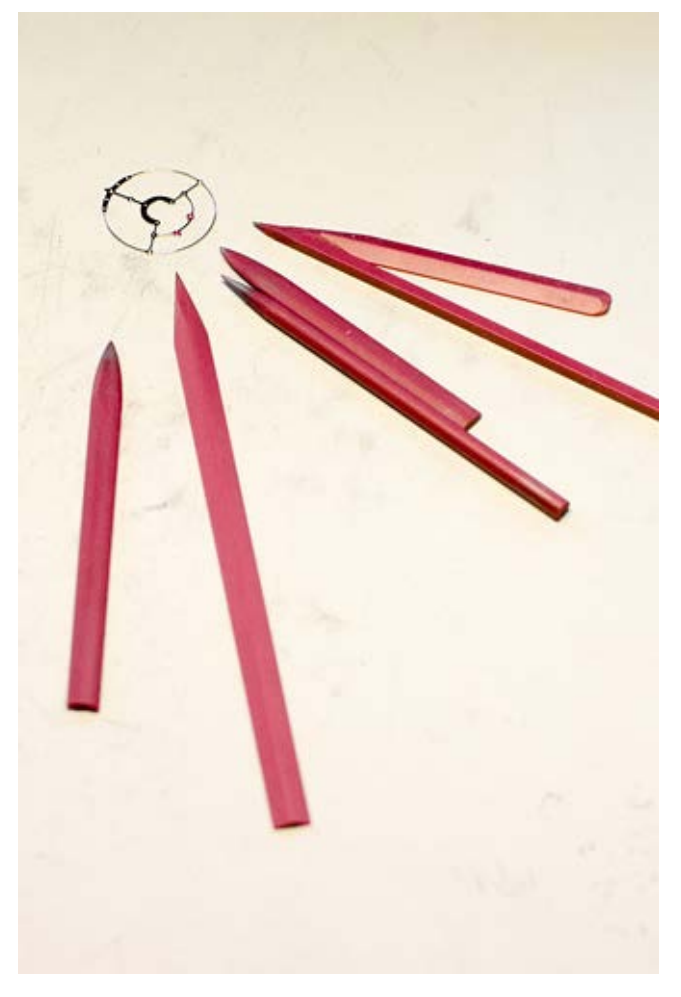
"Bird's tongues" used to bevel the tourbillon cage

Beat has a neat storage for all the parts used in his watches and clocks. Even they have their proper Secessionist armoire. Evidently, apart from having all parts in stock, Beat would be in a position of reproducing any part he needed, should there once be a shortage.