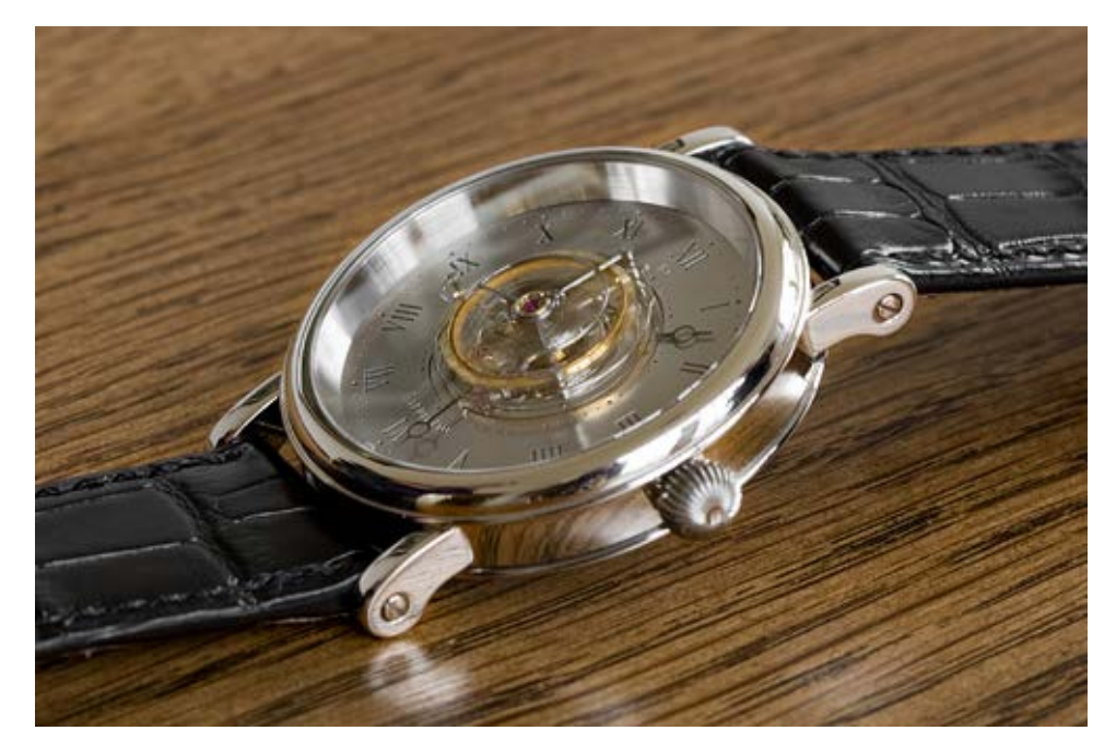
It's impossible to get your eyes off the H1