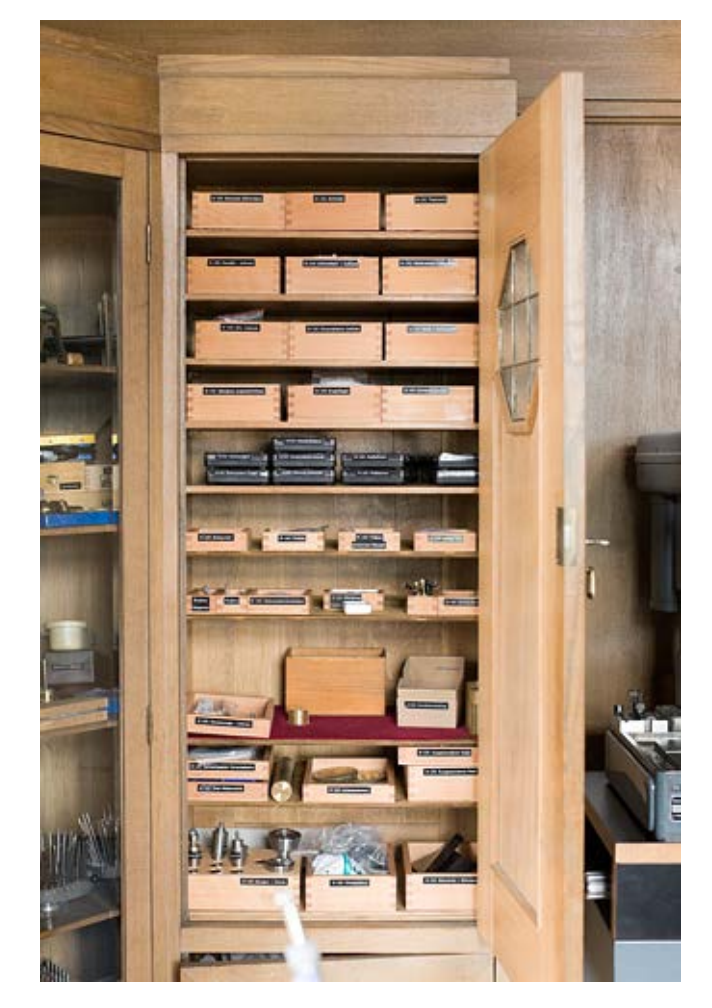
Where the parts are stored