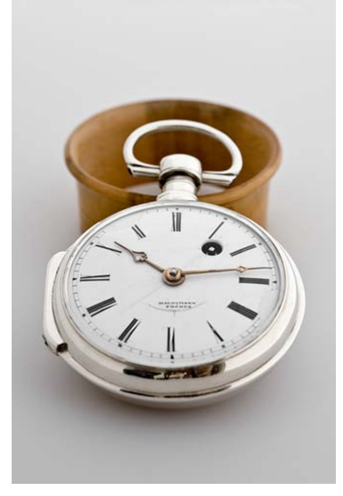
No joke: the 'Haldimann' pocket watch

Since that first find Beat has tracked down a couple more Haldimann pocket watches. One of the finest pieces sports a dead second and little jumping seconds. Beat has decided to leave the movement completely untouched as he wanted to preserve it as a proof of the excellence and refinement achieved back then. The movement finish is indeed exquisite.