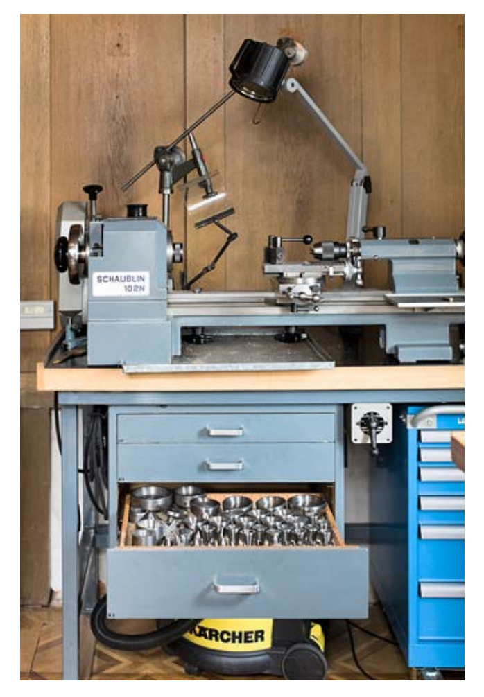
Precision lathe on the parquet