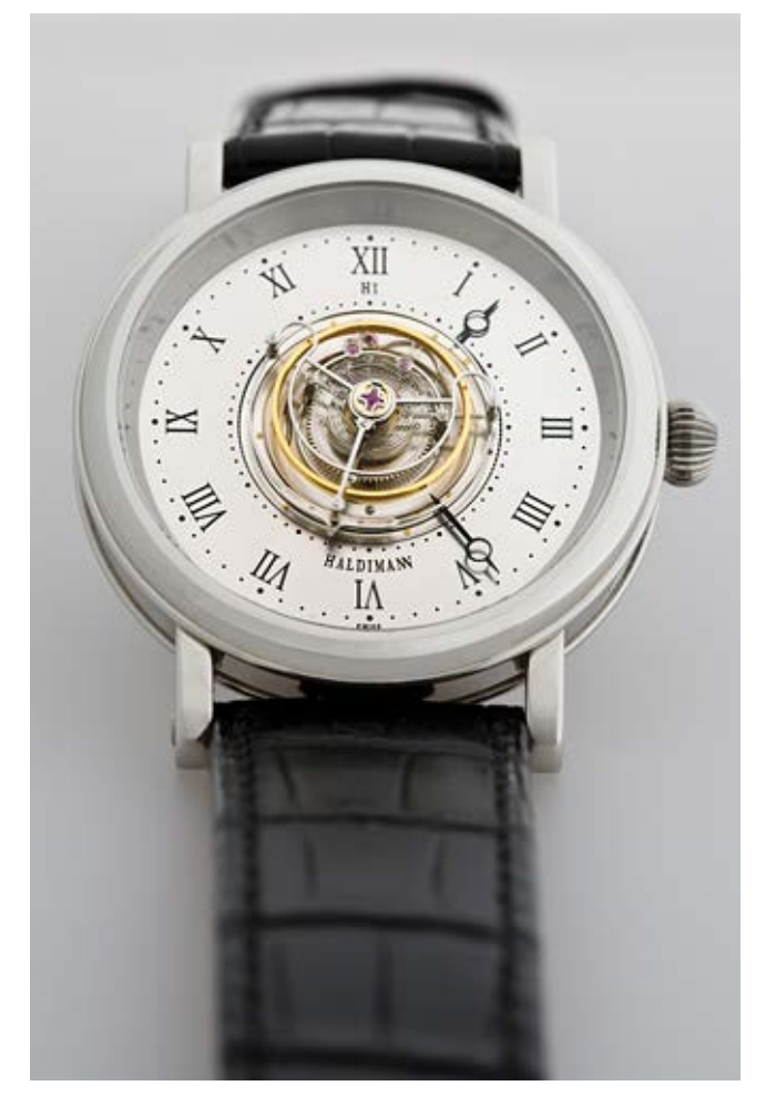
A tourbillon for your heart: the singing H1

It goes without saying that the H1, too, has the classic Haldimann case dimensions. Nevertheless, the tourbillon has an impressive diameter of 16.8 mm. The balance measures 14.14 mm in diameter. Probably better than any other Haldimann creation to date, the H1 epitomises Beat's (I dare say) philosophical approach to watchmaking. His aim is to enchant and captivate the admirers with the movement. Only after enjoying the cathartic and soothing motion of that revolving sculpture in the heart of the watch shall we read the time — if we really need to. And if you ever pondered the beauty of a Haldimann watch you know that the second step is indeed optional.