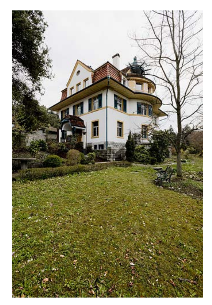
The Haldimann mansion

built in 1907 in the typical turn of the century style. Being a man of great consistency, Beat accordingly furnished the whole living and workshop area with furniture from the German Secession period. So, wandering around those generous rooms, one immediately understands where Beat and his team draw all their patience and energy from. The workshop is a landmark of taste and harmony.