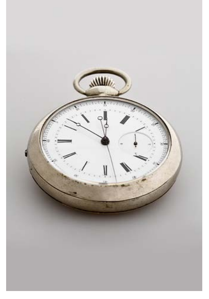
Antique 'Haldimann' pocket watch with dead second