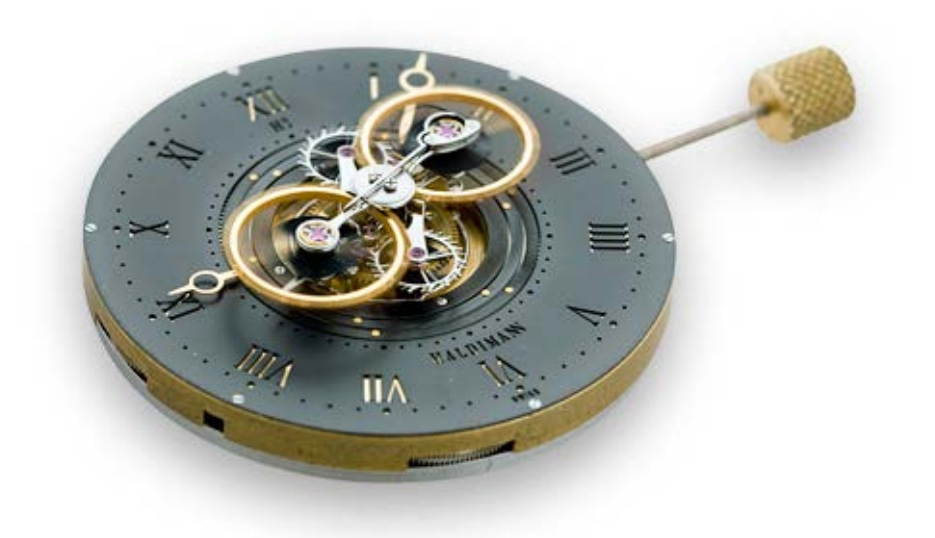
Two flying tourbillons for your head: the ingenious H2

Let's step into the present now and take a close look at our Haldimann's creations. Remember that garden sculpture I mentioned at the beginning of this article? The flames that are spat out of the two pillars interact with each other: the flame coming out of one of the towers provokes the other pillar to produce a flame as well. The whole magic is based on the principle of resonance. And resonance is also one of the leitmotifs in Beat's watchmaking. One of the most impressive embodiments of this phenomenon is the celebrated Haldimann H2.